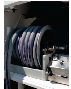
1½" Food-grade lined hose & electric reel