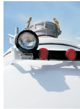
LED & DOT approved lighting