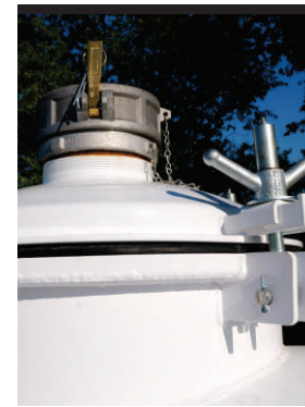
Rear fill tower