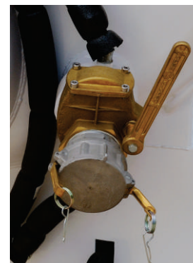
3" Rear Fill Valve c/w 3" Camlock Coupler & Dust Cap