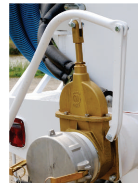
6" Rear Unload Valve c/w 6" Camlock Coupler & Dust Cap